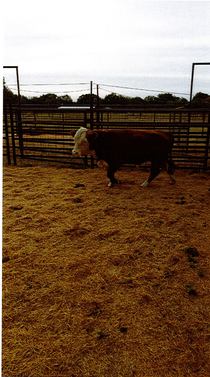
Side of hereford bull